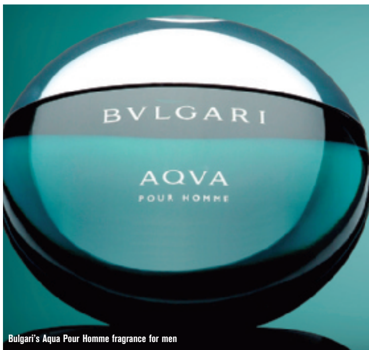
Bulgari's Aqua Pour Homme fragrance for men

Wear a fragrance that embodies spring and makes you feel sexy. For men, Bulgari's new Aqua Pour Homme ($48 for 1.7 oz. spray, $68 for 3.4 oz. spray) mixes the scent of Posidonia , an aquatic plant, with Petit Grain , a combination of orange tree leaves and mandarin. It's also part of a complete bath line that includes after-shave emulsion ($50 for 3.4 oz.), a deodorant stick ($22 for 2.7 oz.), and a shampoo and shower gel ($35 for 6.8 oz.). Bulgari is available at Saks Fifth Avenue and Neiman Marcus.