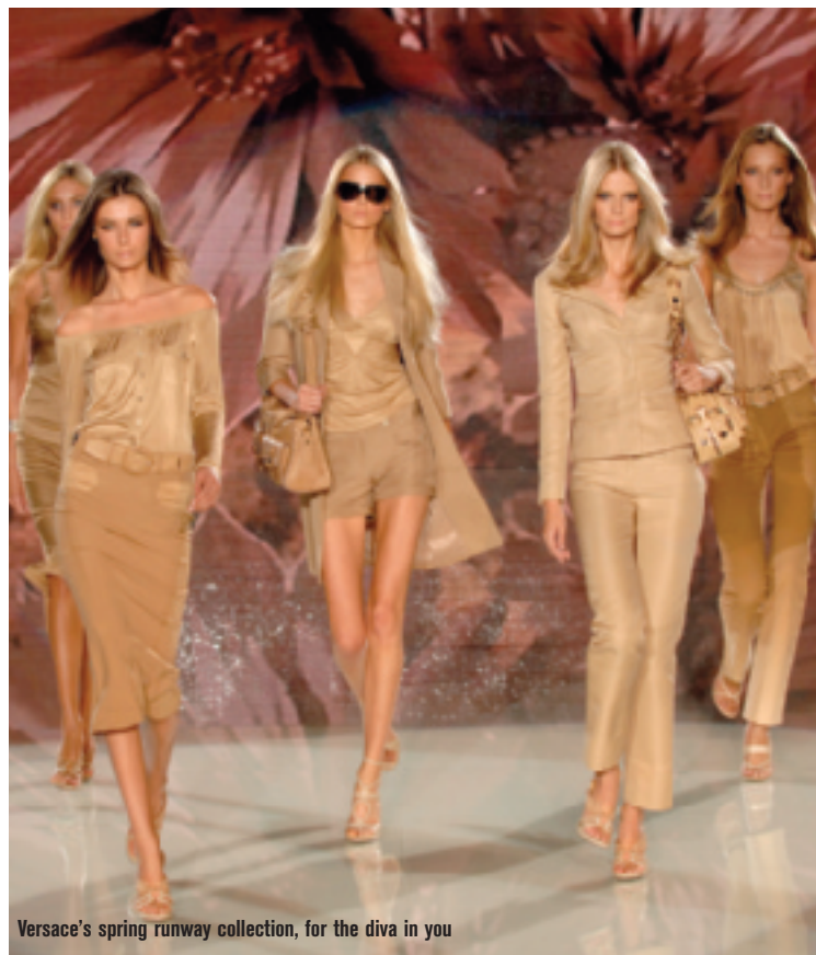
Versace's spring runway collection, for the diva in you

tailors in the Abruzzi factory make the 200 models, of which a quarter are made-to-measure. While there, also inquire about the store's many other exclusive Italian offerings, from Ermenegildo Zegna sportswear to Testoni shoes. For women, it means heading to Peoples, to try on anything by Alessandro Dell'Acqua. His designs are much-loved by Jennifer Lopez and Jessica Simpson. This season, look for his black lace, body-skimming gowns and bustier dresses, an homage to the 1950s. Neiman Marcus , 3393 Peachtree Road, 404.266.8200, www.neimanmarcus.com ; www.brioni.com . Peoples , 3236 Roswell Road, 404.816.7292, www.alessandrodelacqua.com .