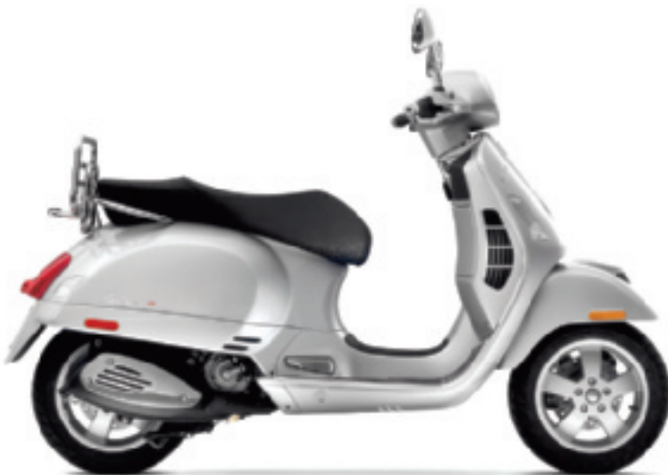
The new Vespa GTS250

Yes, Ferraris are hot. But, our Italian ride of choice this season is the Maserati Quattroporte Executive GT or Sport GT. Launched last