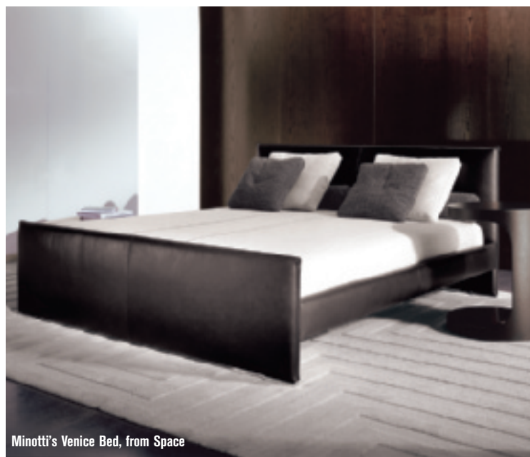
Minotti's Venice Bed, from Space