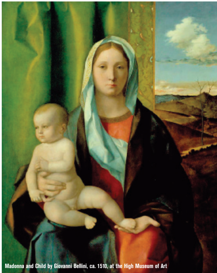
Madonna and Child by Giovanni Bellini, ca. 1510, at the High Museum of Art