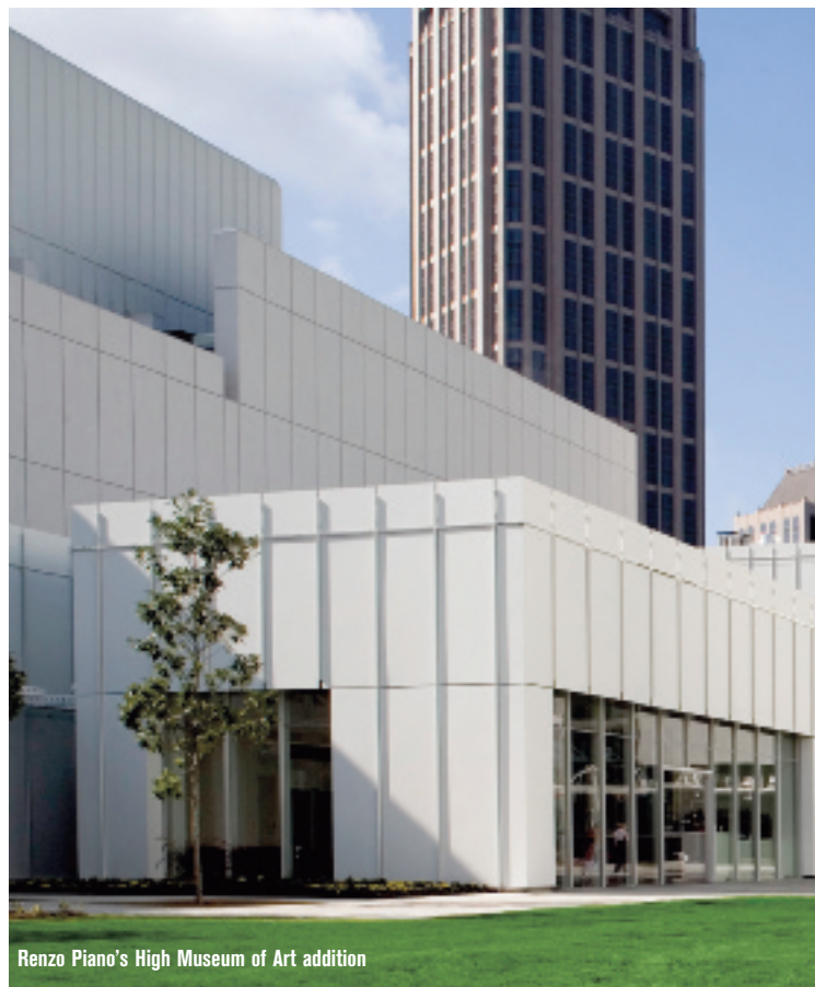
Renzo Piano's High Museum of Art addition