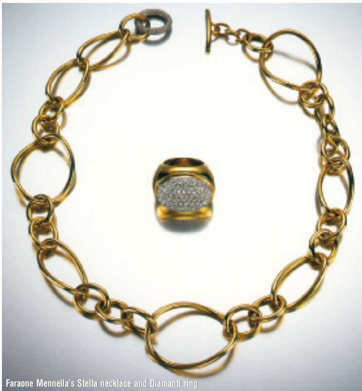
Faraone Mennella's Stella necklace and Diamanti ring

Wear a watch by day that reminds you of trips to the theatre and cocktail parties rather than stacks of faxes or laundry waiting for your return. Pippo Italia's colorful collection comes in 10 case shapes and more than 100 color combinations for men and women. Between the Swiss-made movements, sapphire crystals and hand-set, full-cut