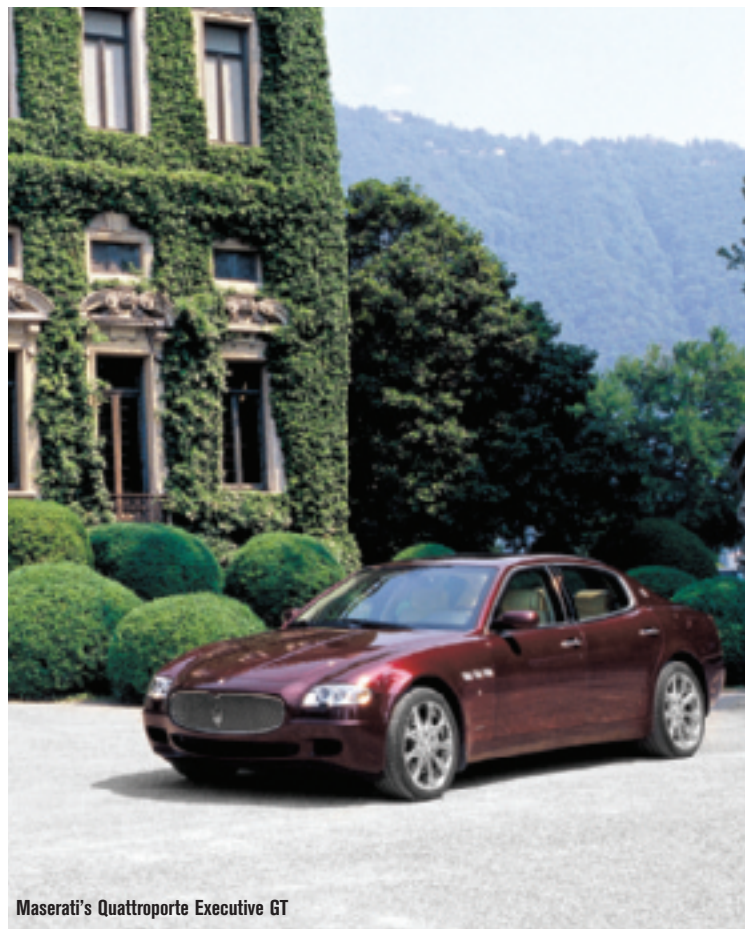
Maserati's Quattroporte Executive GT

month in Detroit, the Quattroporte is considered by many experts the best car of the year. It comes with more than 4 million combinations and Poltrona Frau leather seats, and it can go from 0 to 60 in 5.2 seconds. There's a four-month wait list at Maserati of Atlanta, so get your name on the list now if you're willing to pay the $102,000-plus price tag. If you can't wait to experience it, you can always fly to Parma, for a two-day Master GT Maserati 2006 driving class. They take place at the Autodromo Paletti di Varano de' Melegari, and are designed to let Maserati fans test the full line of cars, from the Coupé and Spyder to the Quattroporte. Ten instructors, headed up by Formula 1 pro Ivan Capelli, will put your skills to the test under all sorts of simulated hellish weather conditions, and keep track of it lap by lap via on-board telemetry. Hotel and dining are included in the 3,500-euro class fee (about $4,173 at presstime). For information on Maserati cars and classes, contact Maserati of Atlanta, 11875 Alpharetta Highway, Roswell, 678.802.5010 or www.maseratioatlanta.com.