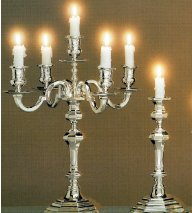
Pampaloni silver from OwenLawrence