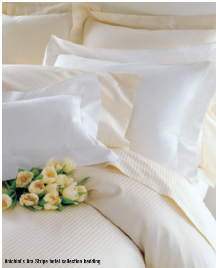
Anichini's Ara Stripe hotel collection bedding

diamonds, you can't go wrong. A stellar example this spring: the Evolution, inspired by the 1930's Villa Malaparte in Capri, with a white mother of pearl dial and brown sateen strap ($3,400). Available at Bloomingdale's , Lenox Square, 3393 Peachtree Road, 404.869.7864, www.bloomingdales.com , and at Bailey Banks & Biddle , Lenox Square, 404.237.9247, www.baileybanksandbiddlestores.com .