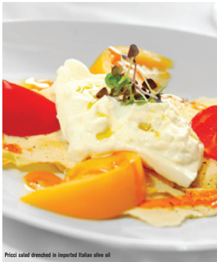
Pricci salad drenched in imported Italian olive oil