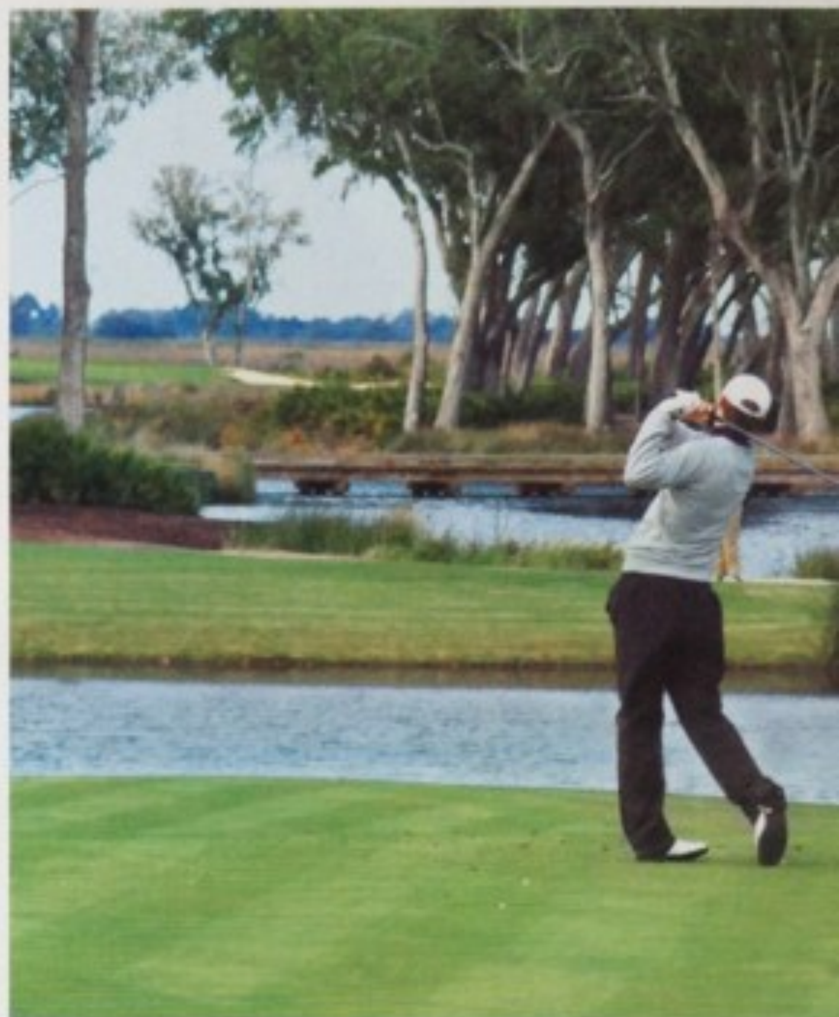
LEFT: The Reserve at Lake Keowee's 200-slip Marina park and boardwalk. RIGHT: Frederica's 11th hole with views of the marsh, designed by Tom Fazio and Sir Michael Bonallack with a hilly terrain, contoured from a dredged lake that accommodates fishing and boating.