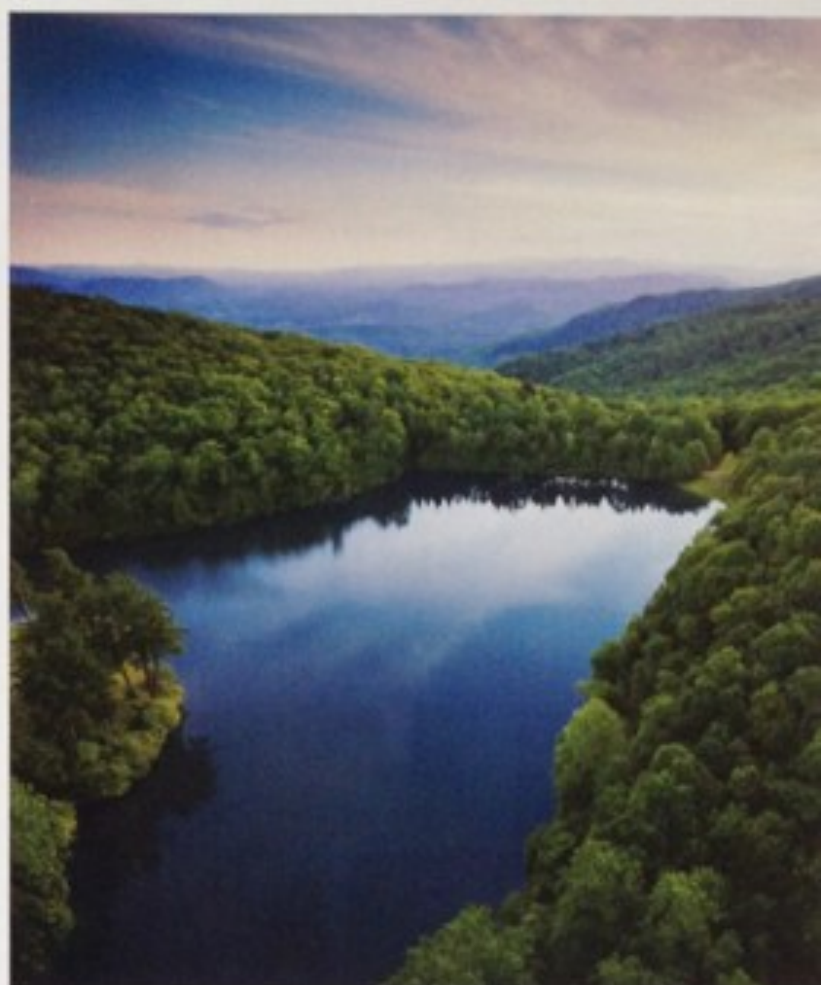
LEFT: Mountain estate in The Greenbrier's Sugar Creek Hollow is similar in style to the new eco-friendly Green Houses to be built in this West Virginia community. RIGHT: Straus Lake in the Blue Ridge Mountains at the site of The Cliffs at High Carolina near Asheville, North Carolina.