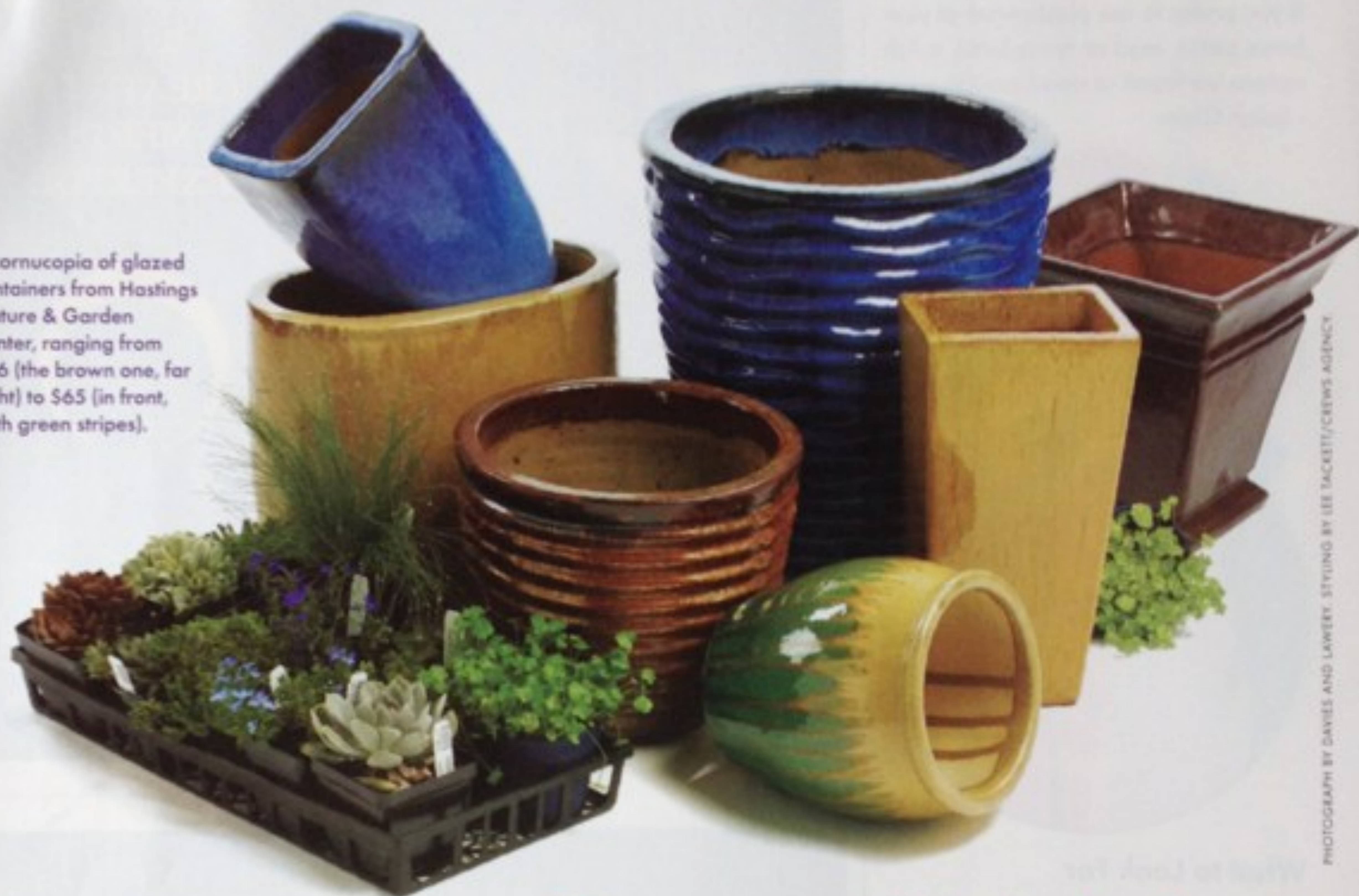
PHOTOGRAPH BY DAVIES AND LAWERY. STYLING BY LEE TACKETT/CREWS AGENCY

A cornucopia of glazed containers from Hastings Nature & Garden Center, ranging from $46 (the brown one, far right) to $65 (in front, with green stripes).